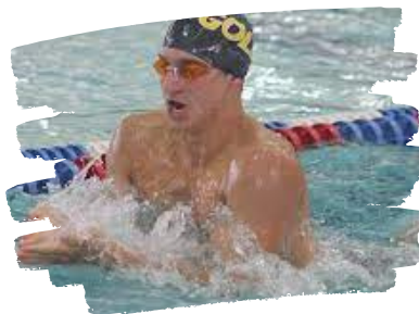
Tom Lalor Swim Invitational 725 visitors 443 room nights $531,850 economic impact