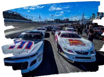
53rd Snowball Derby 9,749 visitors 8,308 room nights $7,906,207 economic impact