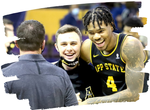
APPALACHIAN STATE UNIVERSITY 2021 SUN BELT CONFERENCE MEN'S BASKETBALL CHAMPIONS