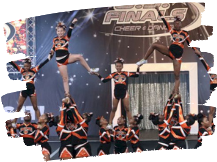
The U.S. Finals Cheer & Dance 7,539 visitors 3,555 room nights $2,829,331 economic impact

These grants are funded by the Escambia County Tourist Development Council (TDC) and are administered by Pensacola Sports for events that demonstrate significant potential to draw visitors to the area.