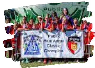
Blue Angel Classic Soccer 1,792 visitors 1,213 room nights $1,669,702 economic impact