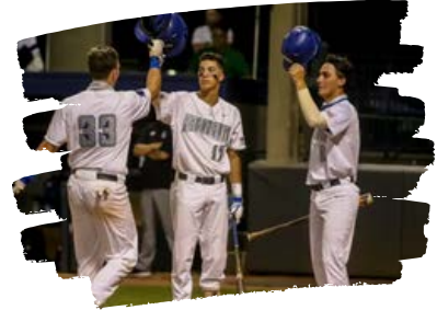
NCAA Division II Baseball South Region Championship 750 visitors 652 room nights $655,497 economic impact