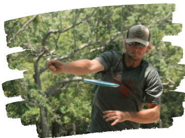
Southern National Doubles Championship Disc Golf 205 visitors 269 room nights $179,363 economic impact