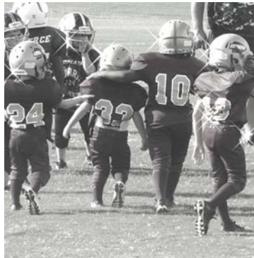
Turkey Bowl Youth Football 1,112 visitors 442 room nights $613,435 economic impact