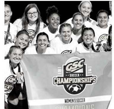
GSC Soccer Championships 1,010 visitors 428 room nights $302,618 economic impact