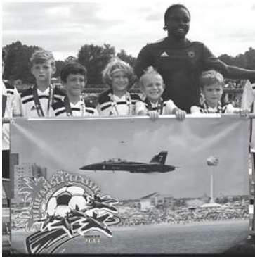
Blue Angel Classic Soccer 1,503 visitors 1,241 room nights $819,030 economic impact

Through our Sports Tourism Grant Program, Pensacola Sports supported 19 events representing 15 different sports including basketball, bowling, disc golf, fishing, football, soccer, swimming. These grants are funded by the Escambia County Tourist Development Council (TDC) and are administered by Pensacola Sports for events that demonstrate significant potential to draw visitors to the area.