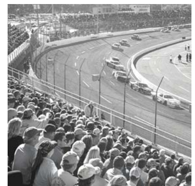
53rd Snowball Derby 8,812 visitors 8,244 room nights $4,975,537 economic impact