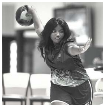
MEAC NCAA Bowling 326 visitors 313 room nights $155,117 economic impact