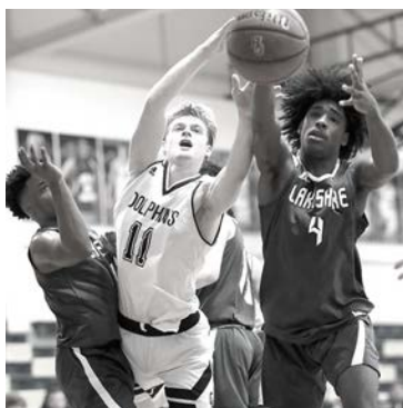
Innisfree Basketball Tournament 1,439 visitors 2,068 room nights $1,065,547 economic impact